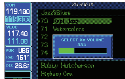
XM Radio channel selection and volume control lets you enjoy optional audio entertainment via the GDL 69A satellite data link receiver 1 .