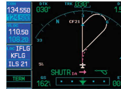
With autopilot-coupled roll steering, both the GNS 430W and 530W can automatically fly the aircraft through holding patterns, procedure turns and other position-critical IFR flight procedures.