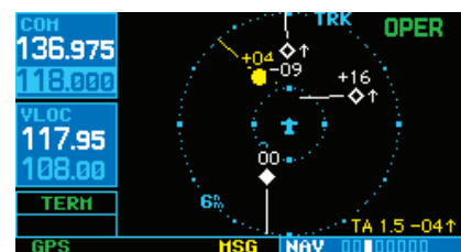
TIS traffic datalink capabilities, available with Garmin's IFR-certified GTX 330 Mode S transponder, let pilots keep an eye on potential flight path conflicts.