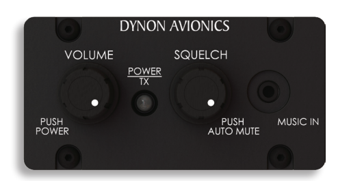
(not actual size)